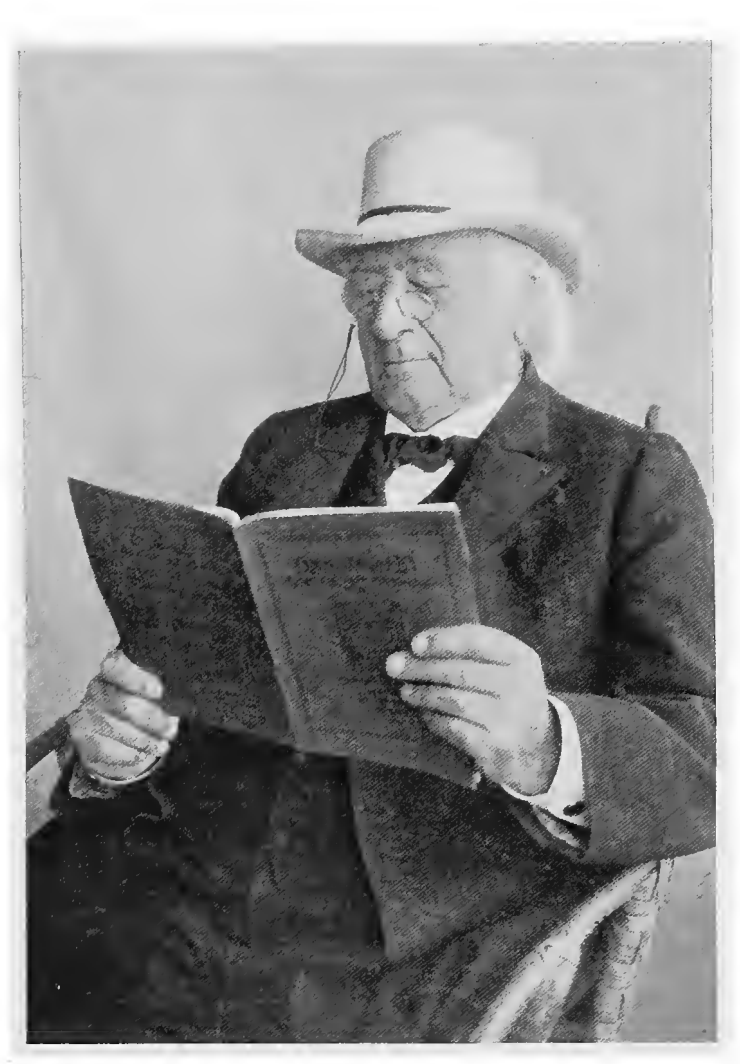
ROBERT COLLYER From a late Photograph, taken about 1905